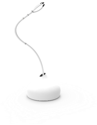
Fig. 1 Design study of the appearance of a streamlined robot arm with high potential acceptance for use in close proximity to humans