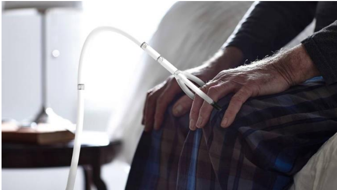
Fig. 3 Vision of a deployment scenario for safe and powerful robot structures