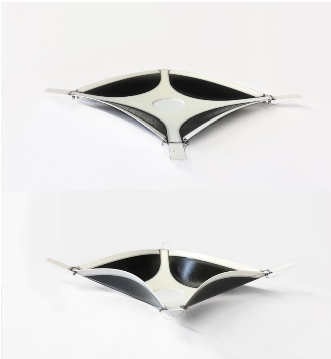
Picture 2: The two different states assumed by the shape-changing modular tray for a vehicle dashboard.