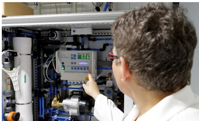
Fig. 2 Compact yet complete: The reverse osmosis unit that supplies ultrapure water for humidifying the fuel cell system during testing.