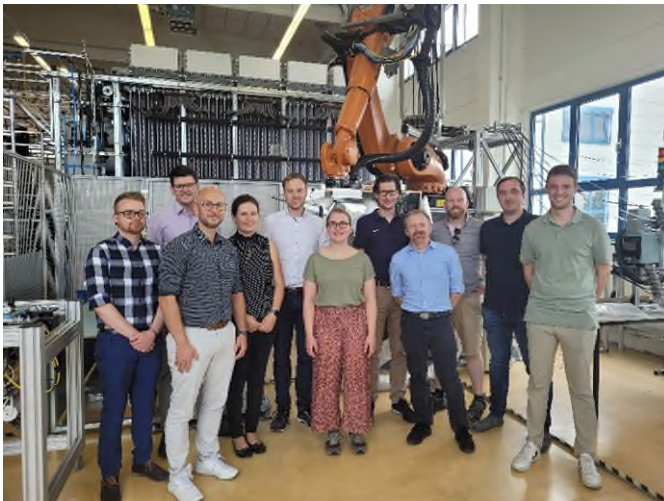
Fig. 3 Part of the COOLBat project team at partner Compositence in Leonberg