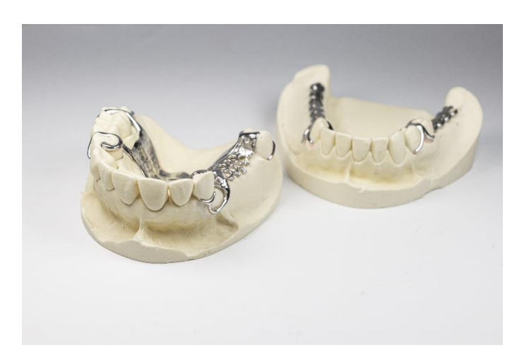
Dental prostheses like these are currently produced by hand in a laborious process. "ATeM" wants to make the production of prostheses faster as well as more comfortable and efficient in terms of costs and resources.